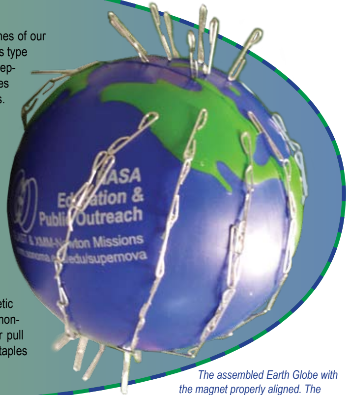
The assembled Earth Globe with the magnet properly aligned. The staples follow the magnetic field lines.

Using the magnet in the globe you can show your students that a stronger magnetic field source will have the staples aligned closer to each other. To properly demonstrate this, the magnet must be spherical in shape. Use a second magnet, or pull the magnet out of the foam rubber globe, and repeat the experiment with the staples placed directly on the magnet.